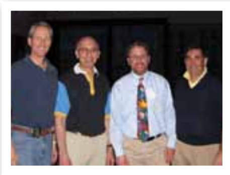
Senior Management Team won the evening's game!

○ Hospice care will always need the support of the community. Please visit www.milfordregional.org and click "Supporting MRMC" to learn how you can make a contribution.