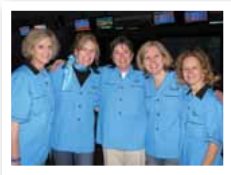
Performance Improvement Team—close competitors of Senior Management Team