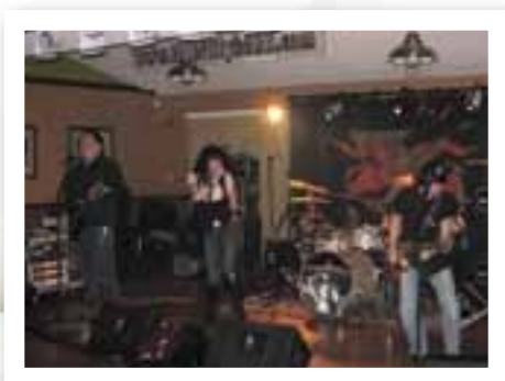
Tigerlily Band entertained folks all evening